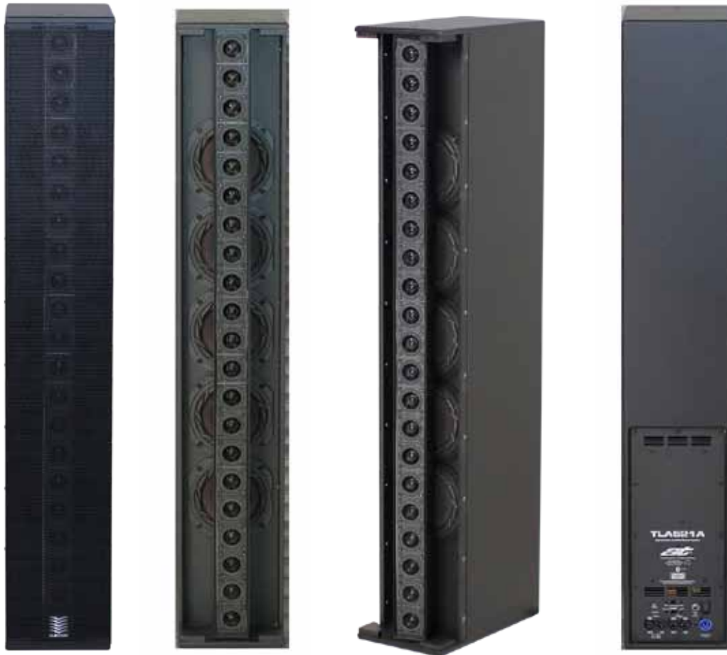
TLA521A left with grille, middle without grille, right back