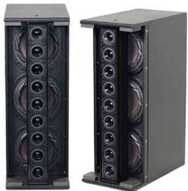
TLA039A top with grille bottom without grille